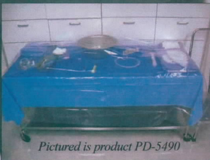
Pictured is product PD-5490

Non Sterile represented by -NS at the end of product name